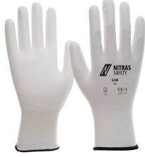
6200 Colour code: 1100