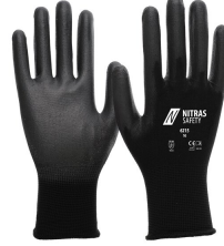
6215 Colour code: 1000