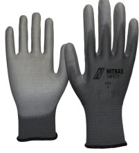
6205 Colour code: 1200