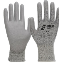
6315 // CUT C Colour code: 1200