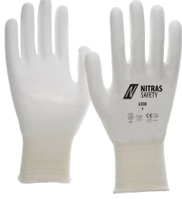
6300 // CUT C Colour code: 1100