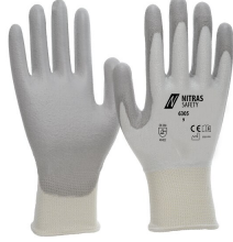
6305 // CUT C Colour code: 1112