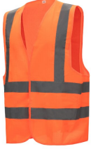
7115 Colour code: 4100