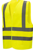
7116 Colour code: 4000