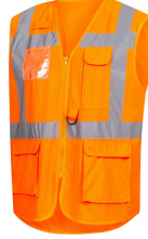
7118 Colour code: 4100