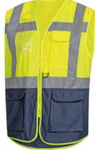
7118 Colour code: 4021