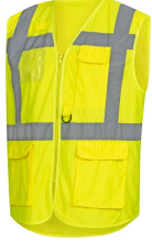
7118 Colour code: 4000