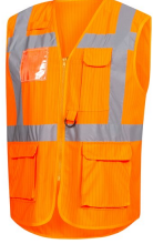
7118 Colour code: 4100