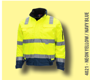
4021 - NEON YELLOW / NAVY BLUE