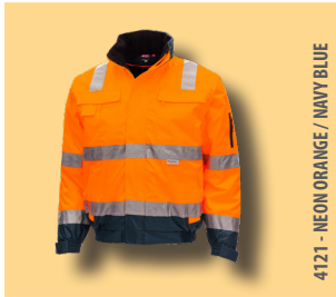
4121 - NEON ORANGE / NAVY BLUE