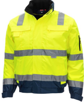
7141 // MOTION TEX VIZ PLUS Colour code: 4021