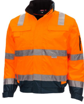
7140 // MOTION TEX VIZ PLUS Colour code: 4121