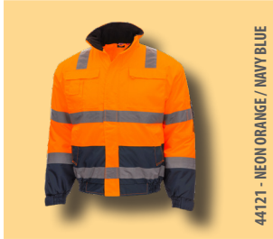
44121 - NEON ORANGE / NAVY BLUE