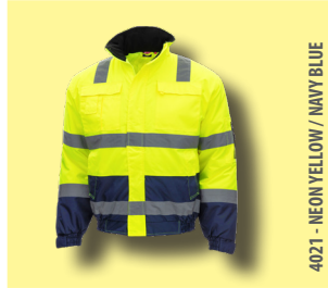
4021 - NEON YELLOW / NAVY BLUE