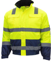
7143 // MOTION TEX VIZ Colour code: 4021