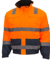
7142 // MOTION TEX VIZ Colour code: 4121