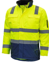
7145 // MOTION TEX VIZ Colour code: 4021