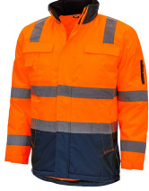
7144 // MOTION TEX VIZ Colour code: 4121