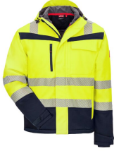
7175 // MOTION TEX VIZ PLUS Colour code: 4021