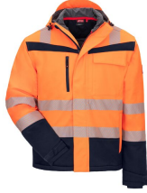
7175 // MOTION TEX VIZ PLUS Colour code: 4121