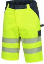
7570 // MOTION TEX VIZ Colour code: 4021