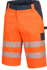
7570 // MOTION TEX VIZ Colour code: 4121